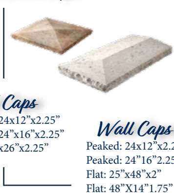
Post and Wall Caps