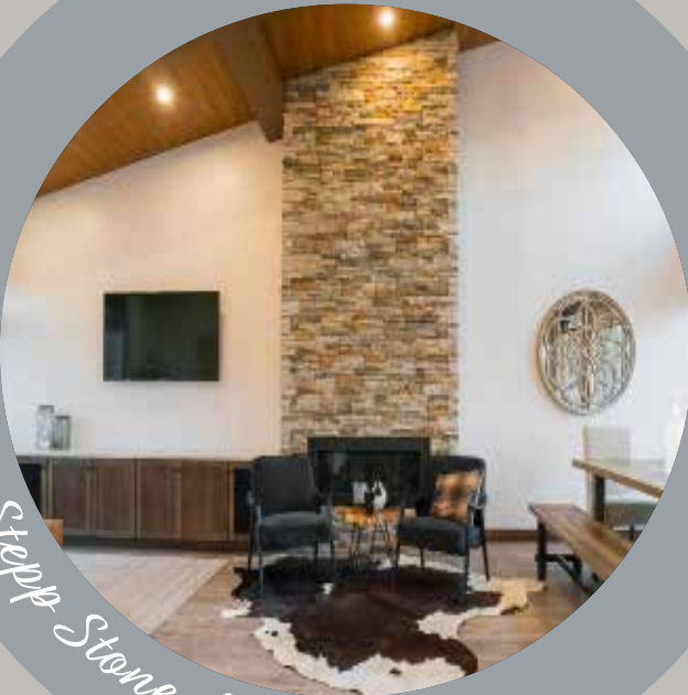
Stepp Stone Aspen