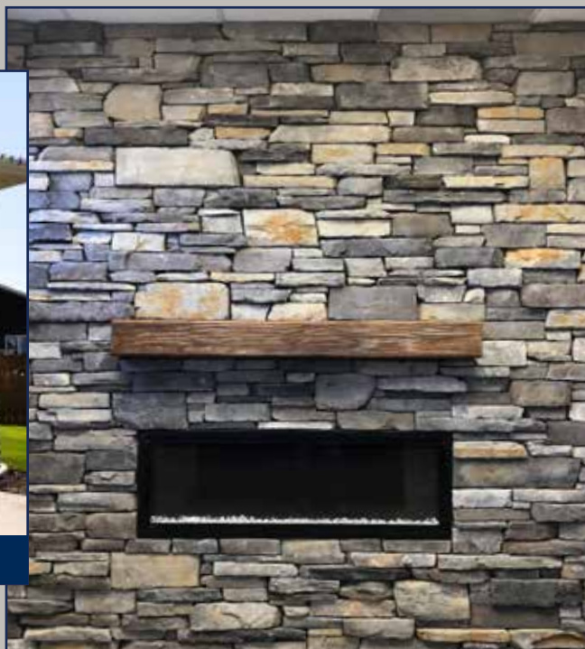
SHADOW LEDGE BELLWEATHER

*Product colors are only as accurate as printing allows. We suggest looking at product samples before making selections.