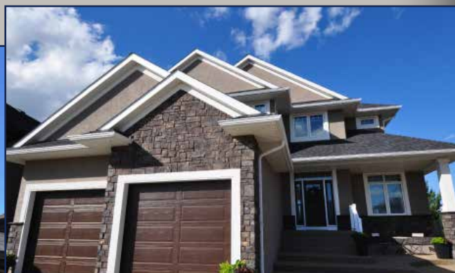
HACKETT BLACK CREEK