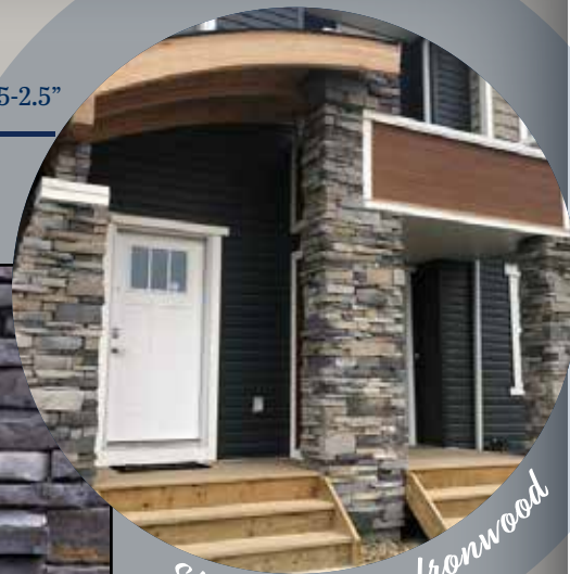
Shadow Ledge Ironwood