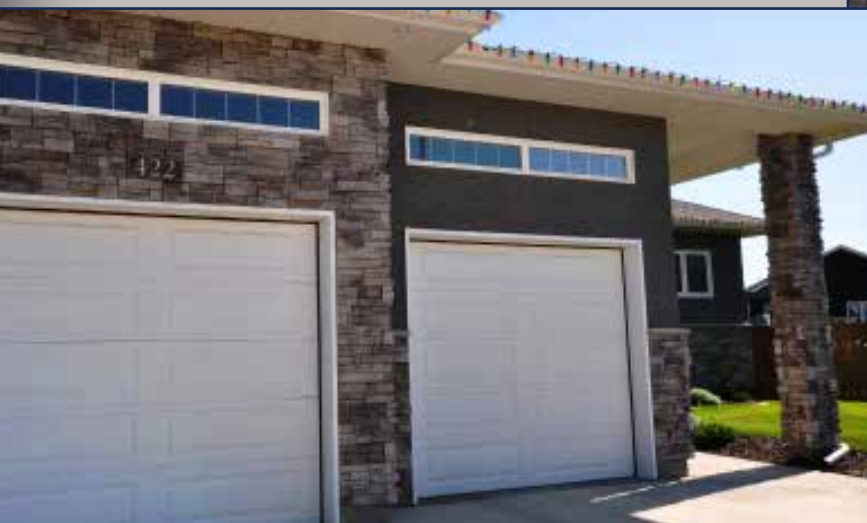
MOUNTAIN LEDGE SLATE