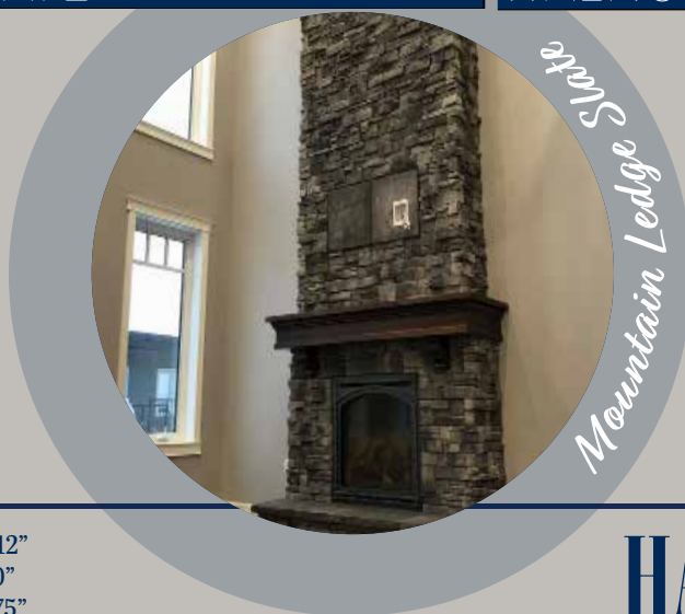
Mountain Ledge Stone

Height: 1.5" - 12" Length: 3" - 20" Thickness: 1.75"