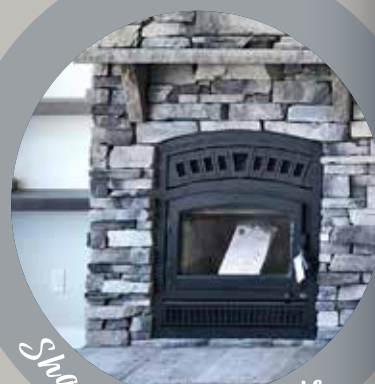
Shadow Ledge Slate

*Product colors are only as accurate as printing allows. We suggest looking at product samples before making selections.