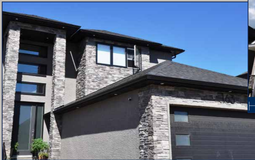
PROSTACK LITE SLATE