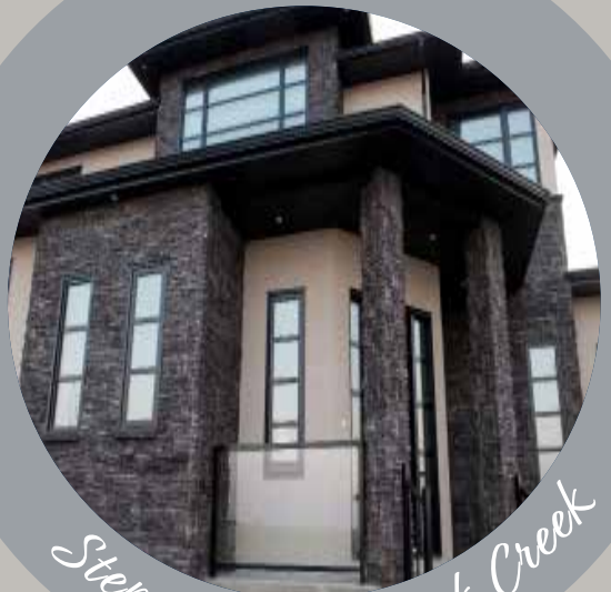
Stepp Stone Black Creek

*Product colors are only as accurate as printing allows. We suggest looking at product samples before making selections.