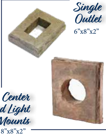
Single Outlet 6"x8"x2"